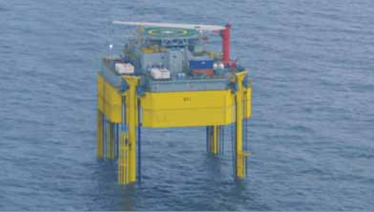
Transformer station built by ALSTOM is set up 22m above water