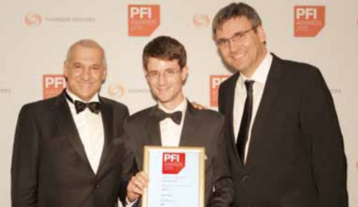
The PFI awards in London, January 2012