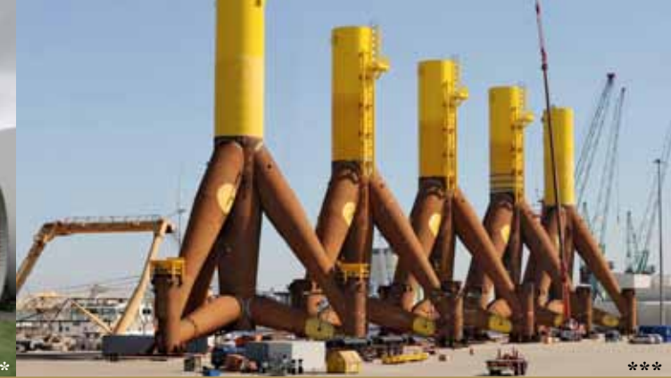
Reliable investment in the market of the future