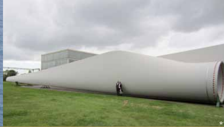
AREVA - state of the art rotor blades